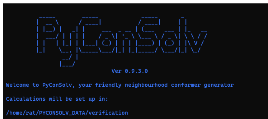
Figure 3 PyConSolv greeting message and calculation folder location.

PyConSolv will show a greeting message and show the folder where the calculations will take place, as shown in figure 3, below.